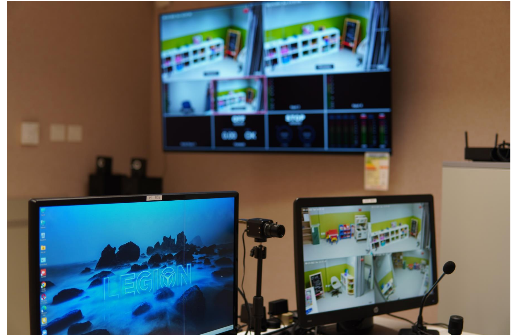
Full angle observation system